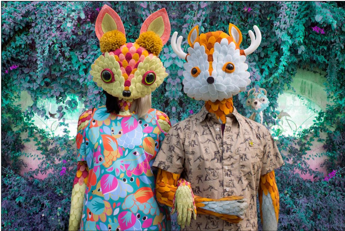
Horrible Adorables - Justin Case

ESPRONCEDA from September 14 to September 30